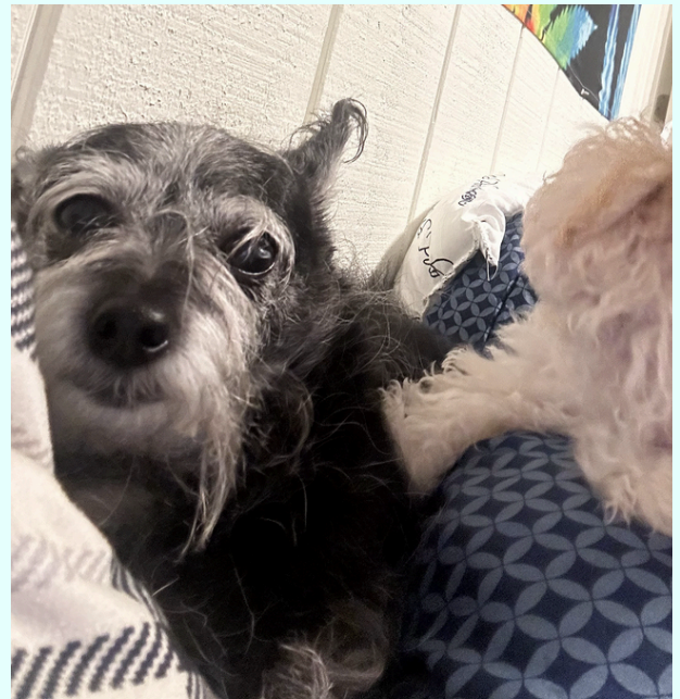
Rockbridge Animal Alliance Where Your Money was Spent in 2024

Since January, we've received 8 requests and fulfilled 7 with the help of our partnering veterinarians. As dogs age, their ability to mask pain makes it harder for owners to detect problems early. That's why routine checkups are so important for older pets.